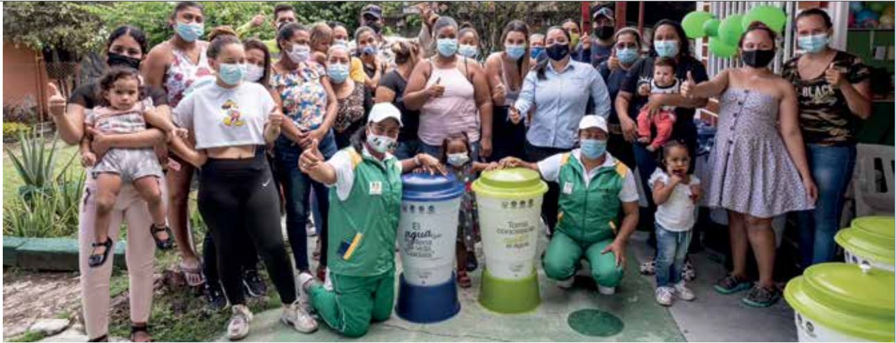
Delivery of safe water filters to communities in Puerto Nare, Antioquia