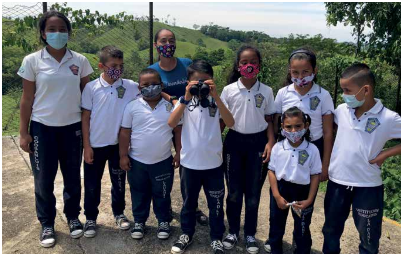
Students of the La Danta Rural Educational Institution, members of the Verde Vivo program