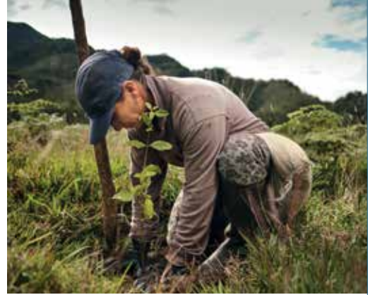
Planting in the municipality of Tamesis, Antioquia