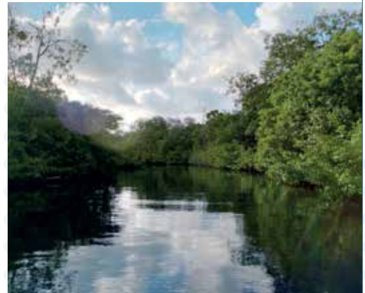
Mangrove ecosystem in Barú, Bolivar