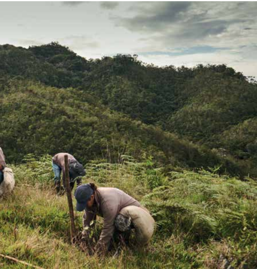
Planting day in the municipality of Támesis, Antioquia