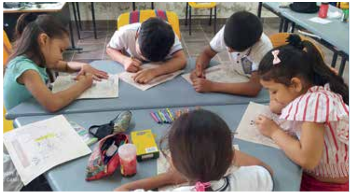
Verde Vivo environmental education with students from the Santa Rosa and Las Mercedes Educational Institutions