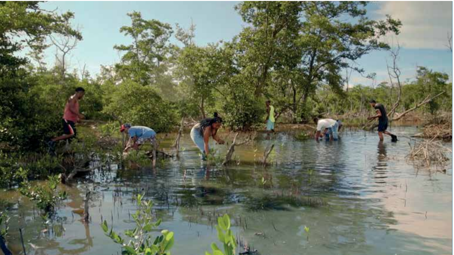
Planting mangrove seedlings in Barú, Bolívar

I also want to highlight a powerful initiative that demonstrates the Fundación Grupo Argos's management capacity. This is the strengthening of the international cooperation line, which, in 2021, managed to conclude an agreement for COP 476 million with Fundación Franklina, a Swiss not-for-profit, for protecting and propagating endangered plant species through the Huella Viva projects in Antioquia and Saldaña, Tolima. We also managed to raise COP 9,8 billion in investments with national partners for implementing conservations, a highlight of which is the tropical dry forest research center.