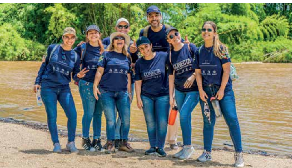
Volunteer event Puerto Triunfo, Antioquia