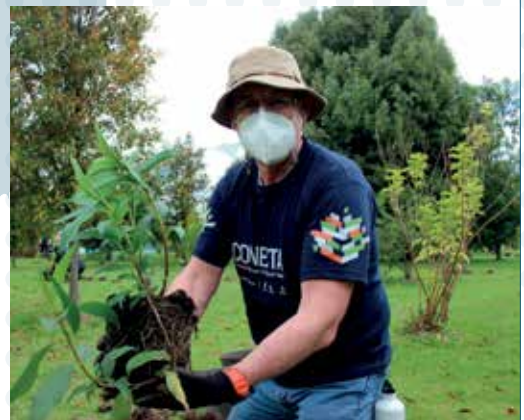
Corporate volunteer event in Bogotá, Cundinamarca