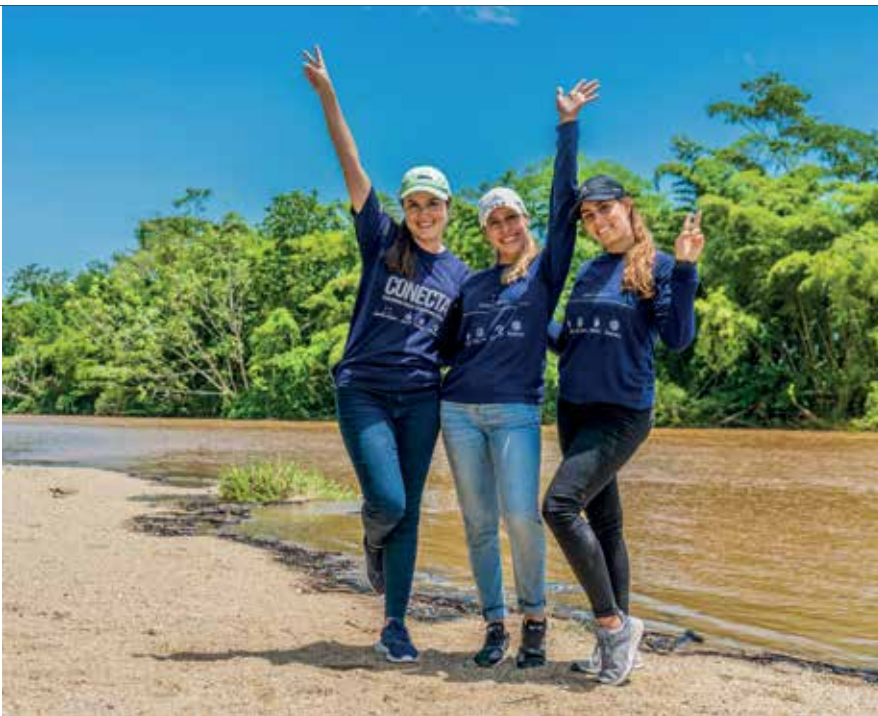
Volunteer event Puerto Triunfo, Antioquia