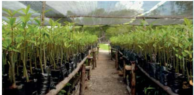
Community nurseries Barú, Bolívar