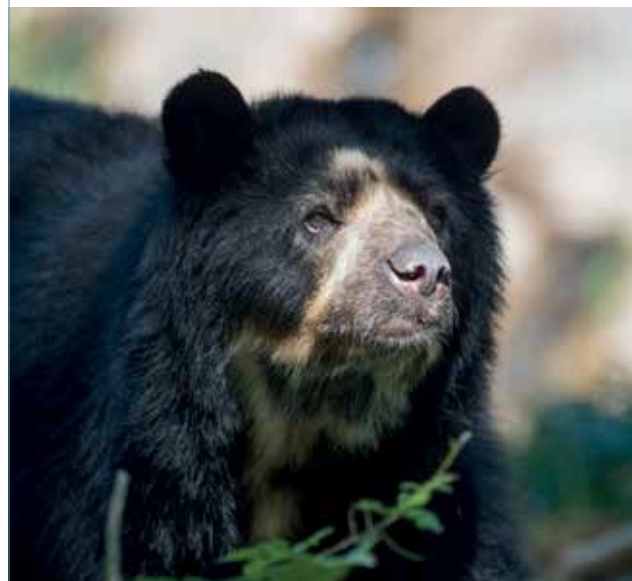
Spectacled Bear, a species protected by the Conservamos la Vida program