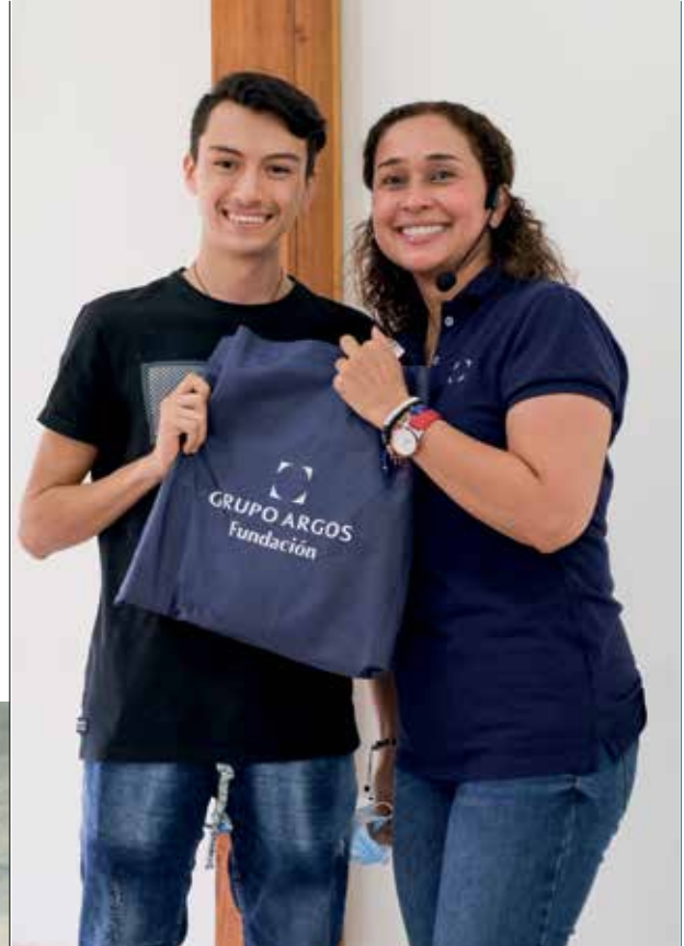
Delivery of Regional Development Scholarships in Cartagena, Bolívar