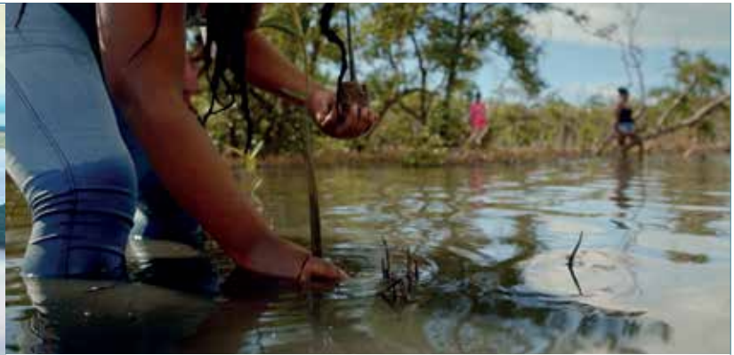
Mangrove seedling planting on Baru Island in Bolívar