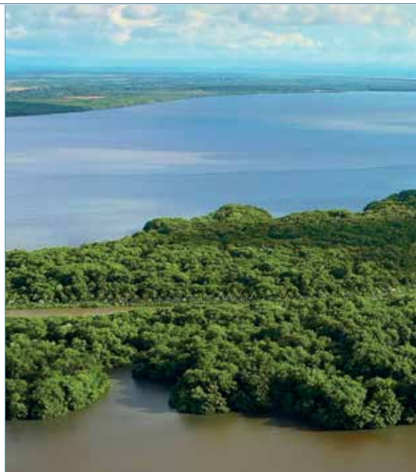
Mangrove ecosystem in Barú, Bolívar

e contribute towards water security in the territories. Our strategy protects water from its source in the mountains to where it flows into the sea, using a systemic analysis methodology with a social and ecological approach, that considers water, biodiversity and social impact as the main variables.