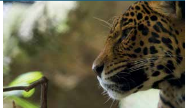
Jaguar, species protected by the Huella Viva program