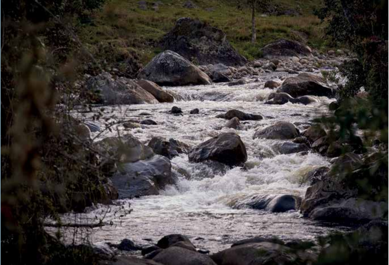
Saldaña River, Tolima