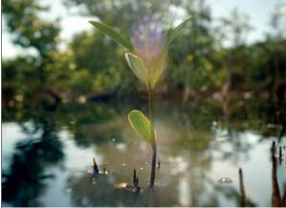
Mangrove seedling planting on Barú, Bolívar