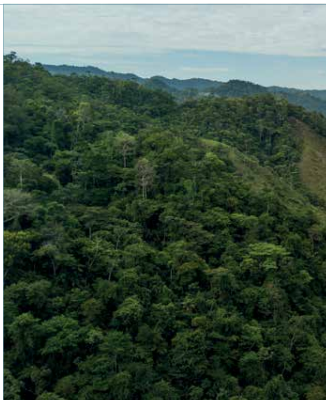
Río Claro Basin, Antioquia

We apply participatory science principles and invite communities to help formulate sustainable alternatives that will allow them to change their relationship with the ecosystem towards a more harmonious vision.