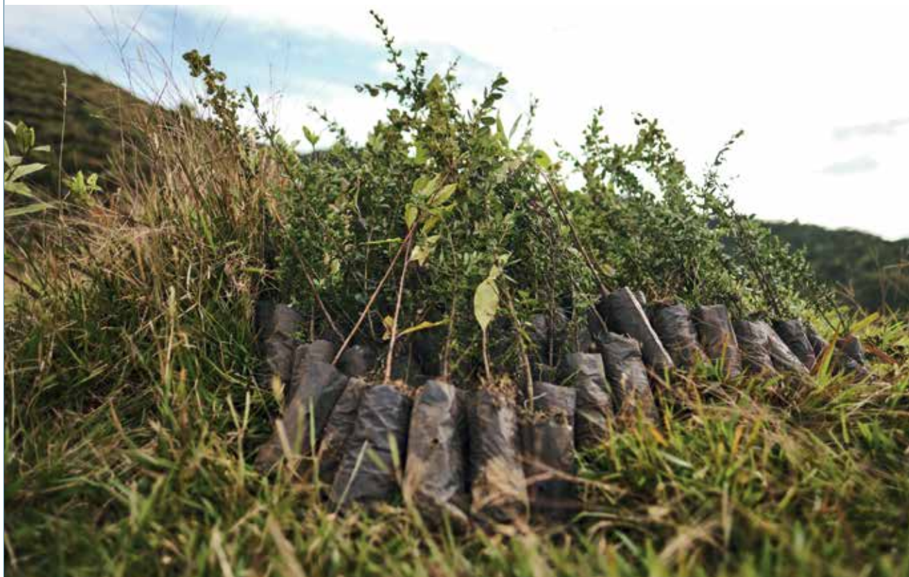
Native tree species planted in Támesis, Antioquia