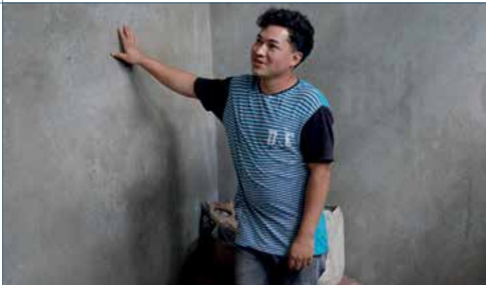
Hogares Saludables program beneficiaries, Medellín, Antioquia